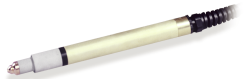
T60M machine torch