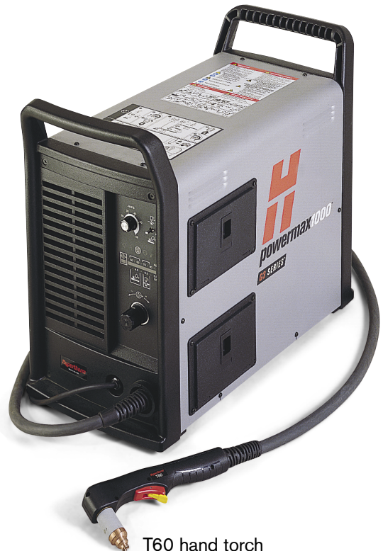
T60 hand torch